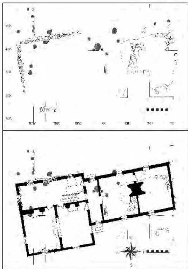
Figure #2. Site Map Showing Major Features Located During the Excavation of the Alder House and Reconstructed Floor Plan Showing the Relationship to the Earlier Cellar House. Many portions of the house area remain unexcavated and the floor plan is conjectural but based on available evidence.