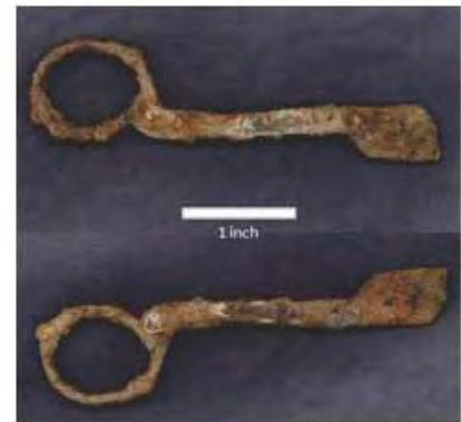
Above: Scissor fragment, mid-17th century. Left: Examples of the very few European ceramics recovered from St. Francis Xavier. • Lot 34: Green lead glazed red earthenware • Lot 37: Rhenish brown stoneware (bulbous mug) • Lot 35: Lead-glazed red earthenware (pan) • Lot 36: North Devon sand-tempered earthenware • Lot 40: Possible Morgan Jones earthenware

representing two sites at opposite ends of the cemetery: a late 18th century site at the northern entrance and a small concentration of what appeared to be 17th century artifacts in the southeastern portion of the cemetery.