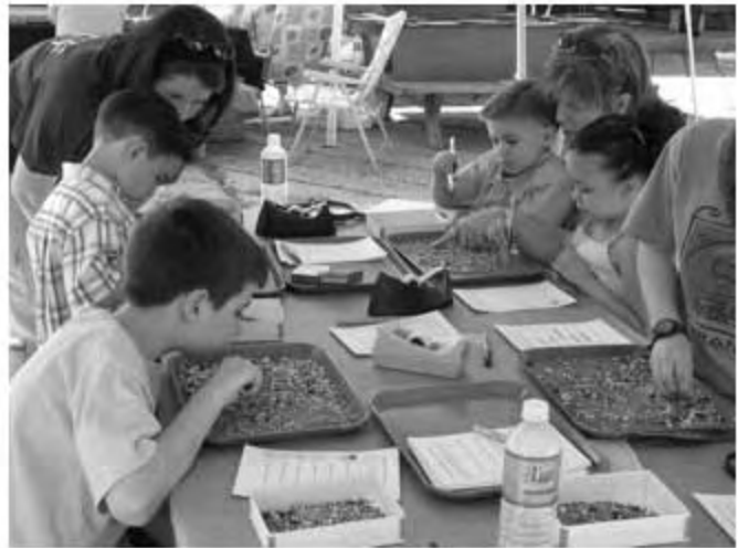
Young visitors at Discovering Archaeology Day search for “planted” seeds in order to discover how archaeologists study plant remains.

four years, Jefferson Patterson Park and Museum, the State Museum of Archaeology, has celebrated by sponsoring Discovering Archaeology Day. This year, on April 14th, archaeologists from seven museums, CRM firms, government agencies and avocational organizations provided hands-on programs and information about archaeology to over 250 visitors. Activities included pottery mending, mock excavations, paleofaunal and paleobotanical exercises, artifact identification, tours of an 18th-century plantation site and of the Maryland Archaeological Conservation Lab, stone knapping, artifact displays and archaeological movies. Not only was it a time for our visitors to learn about archaeology, but a great way for Maryland archaeologists to catch up with each other and share current research. The evening ended, as always, with a barbecue and beer bash for participants!