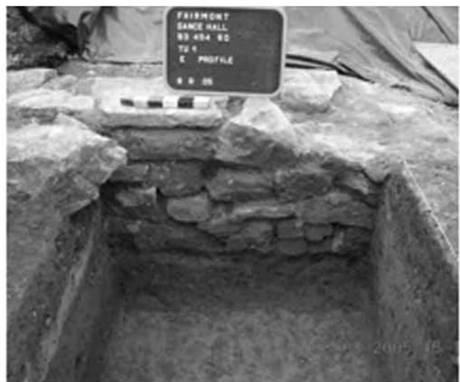
Photograph 1. Wall found at the Dance Hall Site (46MA62).

Research suggested that Phase Ib archaeological investigations might discern evidence of ethnic and economic groups (white collar workers, middle class factory workers, miners, and railroad employees) that are conspicuously underrepresented in the historic record of Palatine during the first few decades of the twentieth century. For instance, white collar workers lived in two sampled blocks while miners, railroad employees, and other blue collar workers resided in two other sampled blocks. Backyard areas were targeted for archaeological survey to explore for deep pit features, such as wells, cisterns, and privies, which frequently contain large quantities of material that can be used to answer a wide range of research questions. It was anticipated that the archaeological record would help define the living conditions of early twentieth century residents in terms of purchasing and consumption patterns, refuse disposal, and sanitation practices.