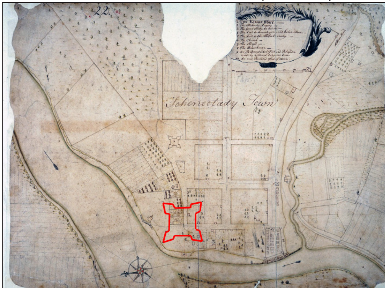
Location of palisade constructed around the settlement of Schenectady circa 1689.