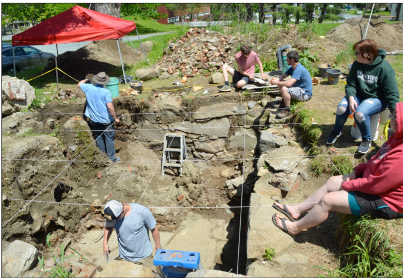
Figure 2. 2019 excavations inside the foundation of the Shaker Boys Shop.

Order. Consequently Plymouth State returned to this structure with a field school for four weeks in 2019, under the direction of David Starbuck, and findings continue to be quite remarkable (Figure 2).