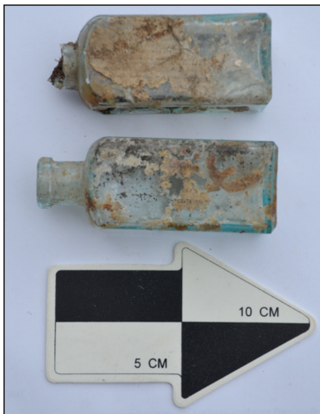
Figure 3 (right). Shaker Valerian bottles, with partial labels, found inside the cellar of the Boys Shop.

As with other Shaker dumps that have been studied in Enfield and Canterbury, New Hampshire, extremely little was Shaker-made. Dishes were bright and colorful, and it would appear that Shakers who lived in the late 19th and early 20th century had much the same consumer tastes as the “World’s People” who surrounded them.