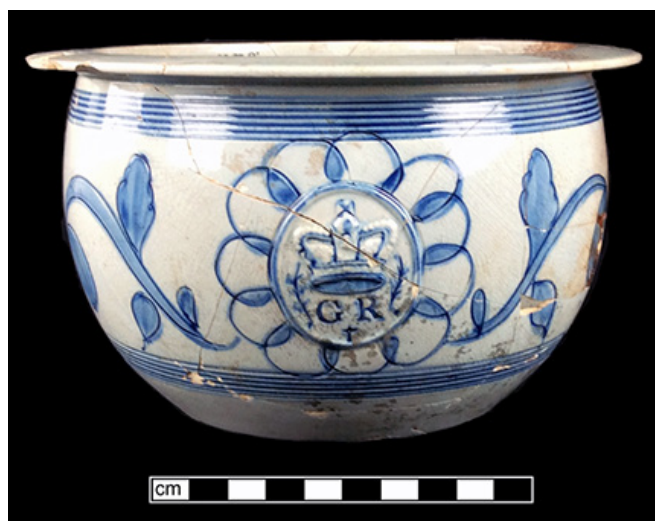
Figure 1. A privy filled in the early 19th century at the Clagett's Brewery site (18BC38) yielded 432 ceramic and glass vessels, including this unusual scratch blue pearlware chamberpot bearing the initials of England's King George.

The formation of the Baltimore Center for Urban Archaeology in April of 1983 was arguably the single most influential action affecting archaeology in the city. Baltimore mayor