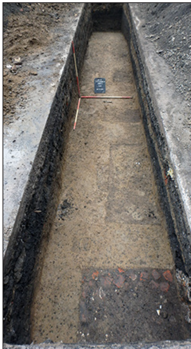
Figure 1. Trench 4 plan, looking east.

The assessment has resulted in the documentation of a series of large square post moulds (Figure 1) believed to represent