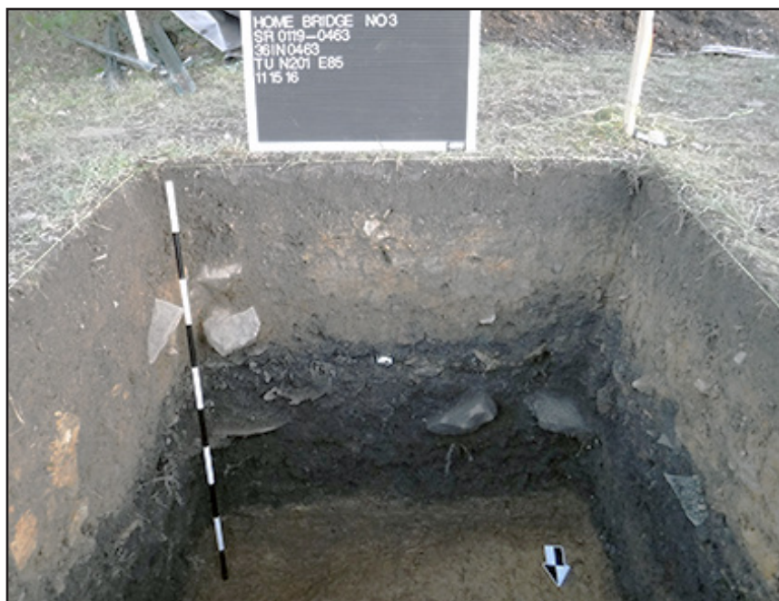
Figure 1 (Left). View of excavations of the midden, which was characterized by multiple lenses of debris from cleaning the forge and from general shop refuse, facing south.

operation into the 1950s is an indication of the reliance of the rural community upon the blacksmith. Data collected from Markosky's Phase II and III excavations indicate generalized blacksmithing on site, including the shoeing of horses, the repair of farm equipment, wagons, and carriages. Many blacksmiths who persisted in the trade began to repair early automobiles before auto repair shops became commonplace. There is some evidence for sand casting at the site, which may have been done to create new parts for broken equipment.