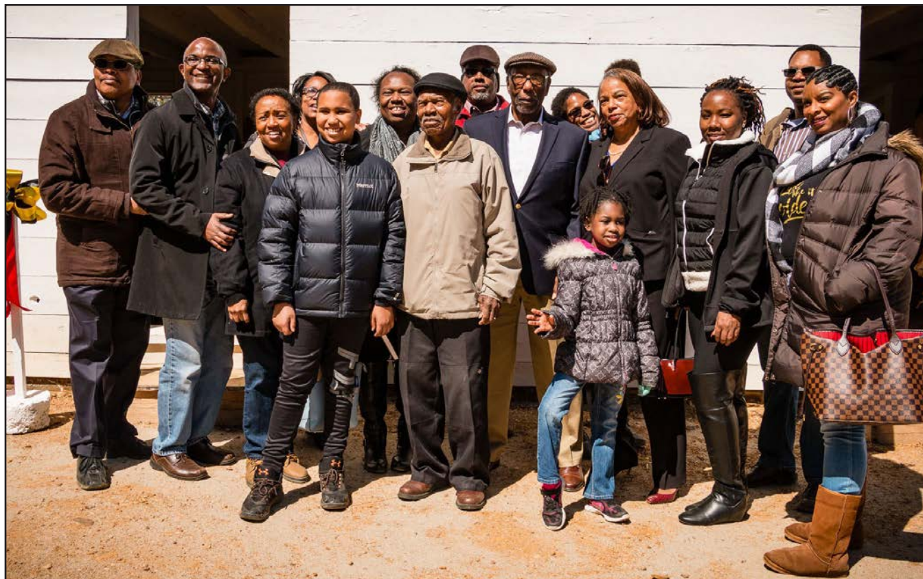
Figure 2. Members of the Milburn and Hall families at the opening of the exhibit.

The exhibit is structured with one room representing the