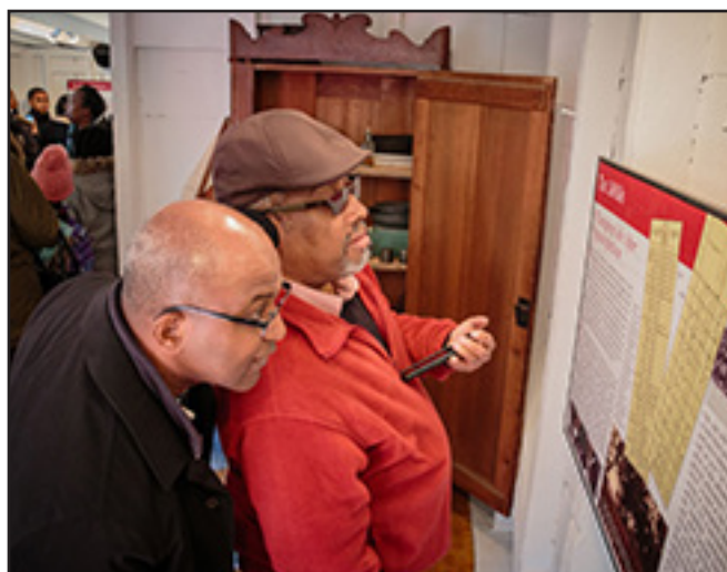
Figure 1. Family members inspecting new exhibit "Struggle for Freedom: African American Life at St. Mary's City in the 19th and 20th Century,"

The archaeological site of the duplex quarter and an associated single family quarter were explored by the museum as part of the examination of the site of the 17th century print-house. A technical report on the 17th century occupation can be found on the museum's web site as a free download ( https://hsmcdigshistory.org/research/publications/technical-reports/ ). The 19th and 20th century components on the site were the subject of Terry Brock's 2014 doctoral dis-