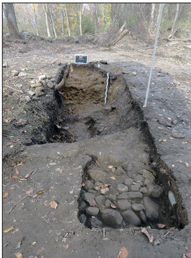
Figure 2. Excavation complete in root cellar at the Fullerton Farm Site (36LA291).