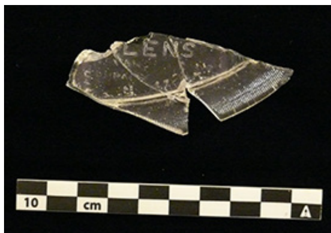
Figure 3. A fragment of a ca. 1914 Liberty Lens (automobile headlight), Macbeth Evans Glass Company, recovered from the McQuilken Blacksmith Shop site.