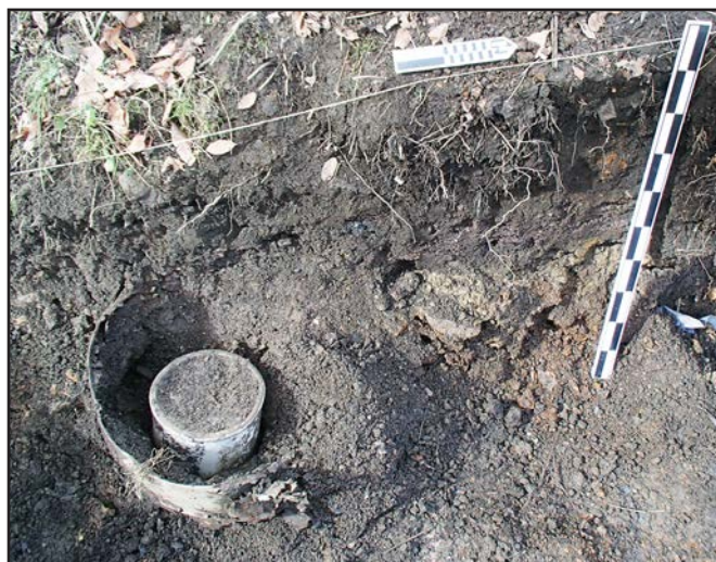
Figure 1. Crock and metal basin at base of excavations in the root cellar at the Fullerton Farm Site (36LA291).

The results suggest that the Fullerton family had a relatively comfortable lifestyle. Ceramic analysis showed that they purchased a wide variety of decorated dishes, much of it from a rich regional array of potters, but also including a significant amount of relatively expensive porcelain. Glass analysis indicated they purchased a wide variety of products available in the region and wider market levels, likely influenced by periodical advertisements and catalogs. Faunal analysis showed that the primary meat being consumed was from sheep (with pork and beef also), supporting the farmstead's placement in the PA SHPO's Southwestern PA agricultural context. The analysis of meat cuts showed that they ate well butchered meat from a variety of areas on the carcass, including dishes that would be ground and stews but also steaks and roasts.