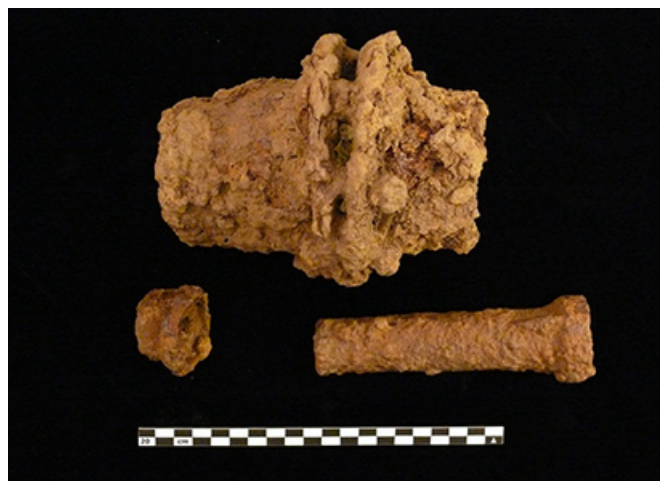
Figure 2. Wagon or carriage wheel parts including a wheel hub (top), a skein (bottom right), and a threaded end cap (bottom left) recovered from the McQuilken Blacksmith Shop site.

The continuance of the McQuilken Blacksmith Shop's