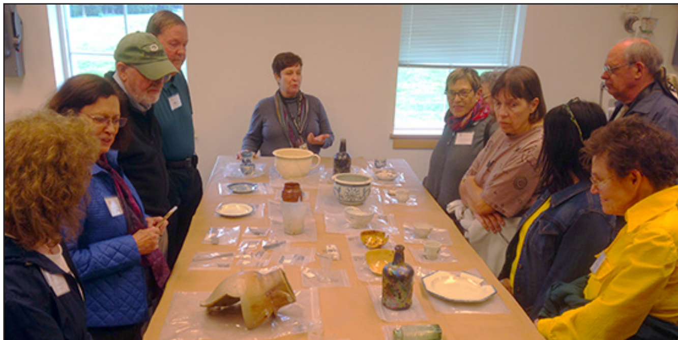
Figure 2. Members of an Archaeological Conservancy tour admire artifacts from the privy at Clagett's Brewery.

Over the next fifteen years, the Baltimore Center for Urban Archaeology conducted historical research on 53 city properties, resulting in 21 excavations. Some of the most